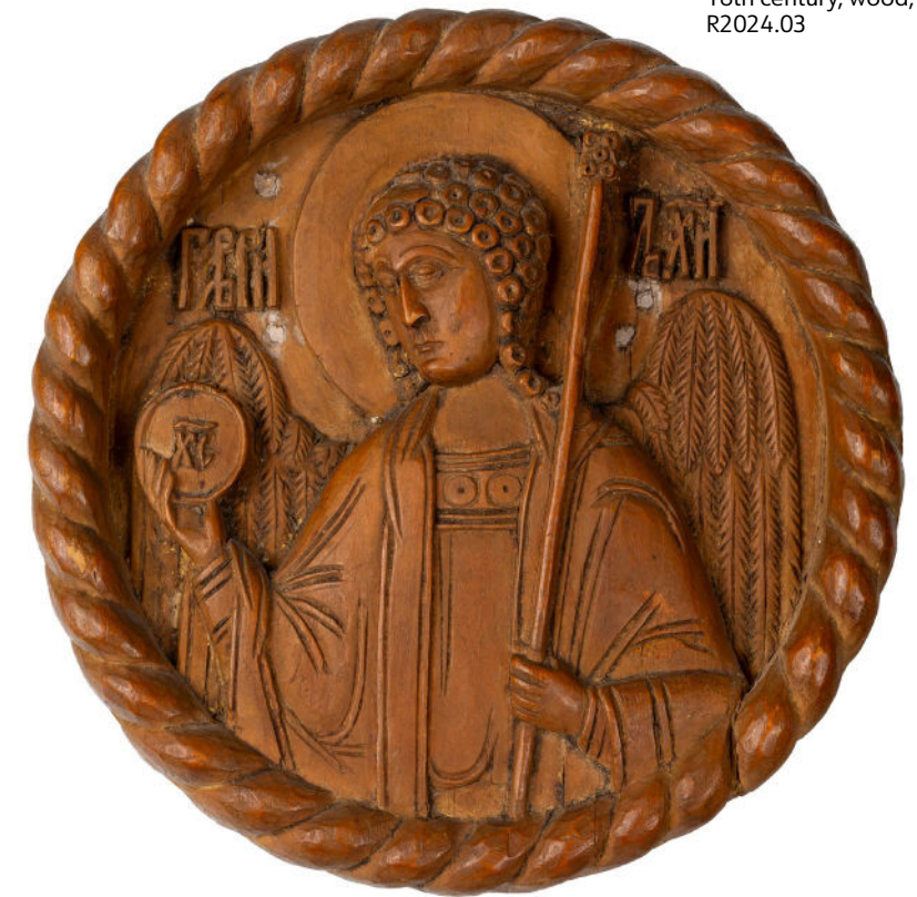
Archangel Gabriel, Russia, 16th century, wood, R2024.03

Late 19th century Russia Egg tempera on wood 25.9 x 21.2 x 2 cm Gift of John Barns, 2024