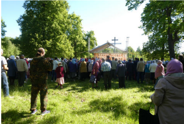
Fig. 9 Service for the Sunday of the Chuvash New Martyrs, Pervomaiskoe, Alatyr district, Chuvashia, 2018