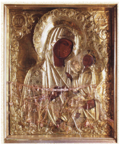
Fig. 1 Icon of the Tikhvin Mother of God from the Tsvil'sk women's monastery, Tsvil'sk, Chuvashia, seventeenth century (image from A.I. Mordvinova, Tserkovnoe iskusstvo Chuvashii [Cheboksary: Chuvashskoe Knizhnoe Izdatel'stvo, 2012])

Further east along the bank of the Volga from Vladimirskoe, a chapel was built and dedicated to Saint Elijah. An eight-pointed cross brought there in 1695 soon attracted the veneration of both Chuvash and Russians so that in 1720 the chapel became the Ilinskaia Pustyn, a hermitage of the Spaso-Iunga monastery founded in 1625 a short distance inland from Kozmodemiansk. 38