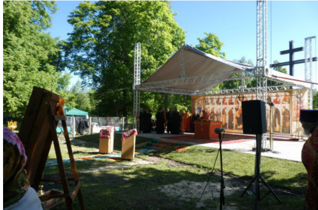
Fig. 10 Service for the Sunday of the Chuvash New Martyrs, Pervomaiskoe, Alatyr district, Chuvashia, 2018