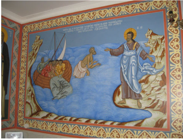
Fig. 6 Aleksandr Kuzmin and Andrei Kurushin, fresco of Saint Peter Walking on the Water, Refectory of the Holy Trinity Monastery, Cheboksary, Chuvashia, 2013