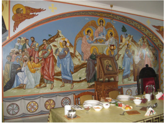
Fig. 7 Aleksandr Kuzmin and Andrei Kurushin, fresco of Christ Feeding the Five Thousand, Refectory of the Holy Trinity Monastery, Cheboksary, Chuvashia, 2013