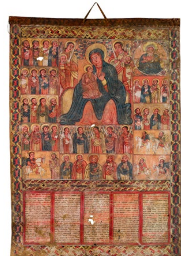
Icon of the Mother of God with Selected Scenes and Saints, Ethiopia, late 19th or 20th century, paint on goatskin, R2023.09