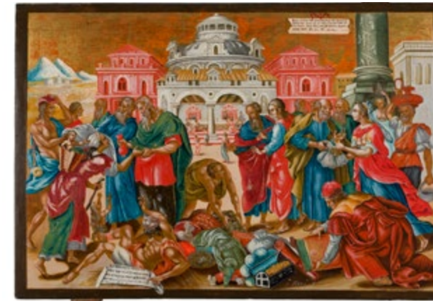
The Distribution of Wealth, Venice, 17th century, egg tempera on wood. R2023.5.2.2

Late 17th Century Ionian Islands Egg tempera on wood 44 x 36.5 cm Museum purchase, funds provided by the Gordon B. Lankton Collections Fund Sold by Schloss Ahlden Fine Art Auctioneers, Germany, 2023