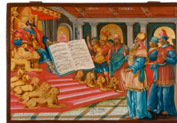
The Song of Songs, Venice, 17th century, egg tempera on wood. R2023.5.2.1