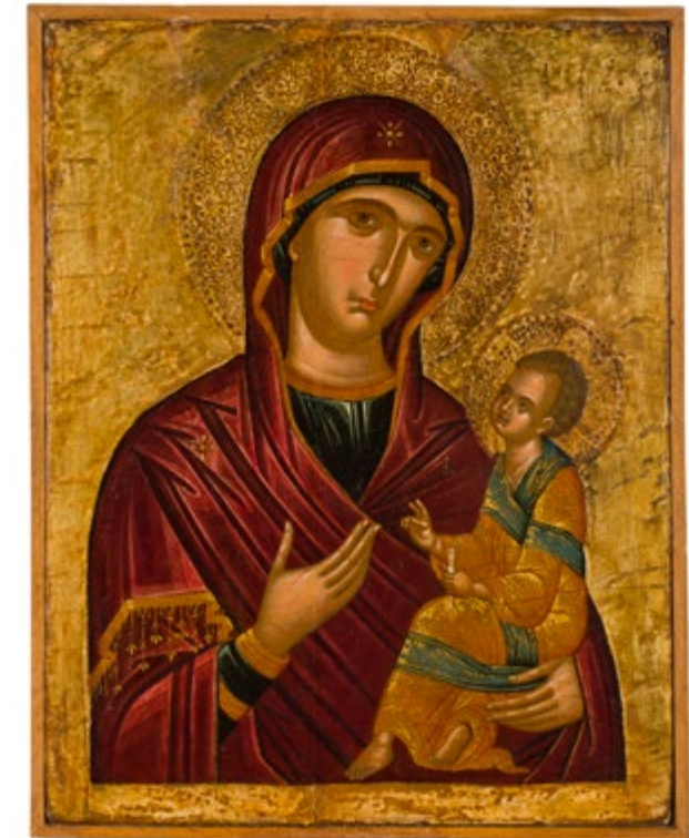
Mother of God Hodigitria, Crete, early 16th century, egg tempera on wood. R2023.5.1