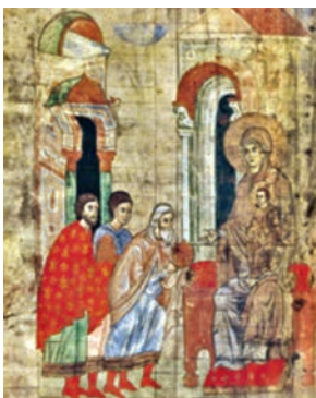
Figure 7. Miniatures from the Siyskoye Gospel. 1340. Saint Petersburg. Russian Museum; Library of the Academy of Sciences.

Thus, in 1340 Ivan Kalita, Grand Prince of Moscow, sent an expensive parchment Gospel manuscript with miniatures to one of the villages on the Northern Dvina River. The donation was recorded in a detailed inscription inserted in the book. That Gospel book subsequently ended up in the northern Siysky Monastery (on the Siya River), was then brought back to central Russia, and is now in the Library of the Academy of Sciences in Saint Petersburg (Figure 7).