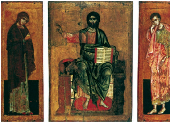
Figure 8. Christ, Mother of God and Saint John the Theologian. Late 14th century. Balkan (Serbian?) icons. From the village Krivoye in northern Russia. Moscow, Tretyakov Gallery.

preceding period were still strong in Russian art of the second half of the 15 th century: the art of the great icon painter Dionysius, which matured during that period, was transitional in nature. Meanwhile, the 16 th and 17 th centuries witnessed the emergence of art usually referred to as the art of the Late Middle Ages. It retained the basic principles of Byzantine art, yet had an important distinction: this reference to antiquity, felt in earlier Russian art due to Byzantine influence, was no longer in evidence.