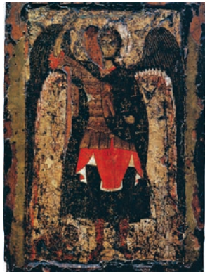
Figure 18. (top) Joshua (before Archangel Michael). Fresco of Hosios Lukas, Greece, 10th century. (bottom) Archangel Michael and Joshua. Russian icon from the late 12th. century. Moscow Kremlin, Dormition Cathedral.

representing individual venerated characters. Its rounded shapes and the smooth modelling of the face in imitation of West European painting show that this icon was connected with Moscow art and the workshops which had evolved under the Kremlin Armory Chamber in the second half of the 17 th century. The theme of the icon is the appearance of Archangel Michael to Joshua, the son of Nun and leader of Israel. The commander of the army of the Lord orders Joshua to remove his shoes because the place where he stands is holy (Joshua 5:13-15). The subject is known in Byzantine art (Hosios Loukas, 10 th century) and in Russian art from the 12 th century (Figure 18). Two more scenes with acts of Archangel Michael are above and below the central representation. Such placement of additional scenes—freely around the central figure without any frames—was frequent in Russian icon painting in the second half of the 17 th century.