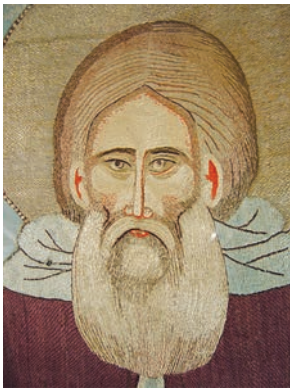
Figure 25. Saint Sergius of Radonezh. Embroidery. Early 15th century. Museum in Sergiev Possad.

Nevertheless, there is a strong iconographic tradition of Russian art and the rich legacy of Russian culture behind this small icon. Monasteries that have long played a big part in Russian life were of two types. The so-called semi-eremitic predominated in Rus' before the 14 th century. The other type—the cenobitic monasteries—stressed community life. From the mid-14 th century the latter type of monasteries fast spread in Rus' in emulation of the Trinity Monastery of Saint Sergius founded not far from Moscow by Reverend Sergius of Radonezh (Figure 25).