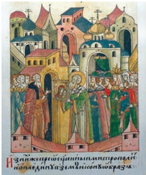
Figure 13. Muscovite Grand Prince Vasiliy Ivanovich gives the icon of the Mother of God Smolenskaya to Misail, bishop of Smolensk. Miniature from the Illustrated Chronicle Compilation. 16th century.

Byzantine icon was brought to Kiev around 1130 and then taken by Grand Prince Andrey Bogolyubsky in 1155 to Vladimir, a city in northeastern Rus'. Yet, the two icons have different iconographic details. In the Mother of God of Vladimir the legs of Jesus are fully covered by His himation whereas in the Feodorovskaya icon they are bent and one of them is open from knee to foot, perhaps, to show the human nature of Christ.