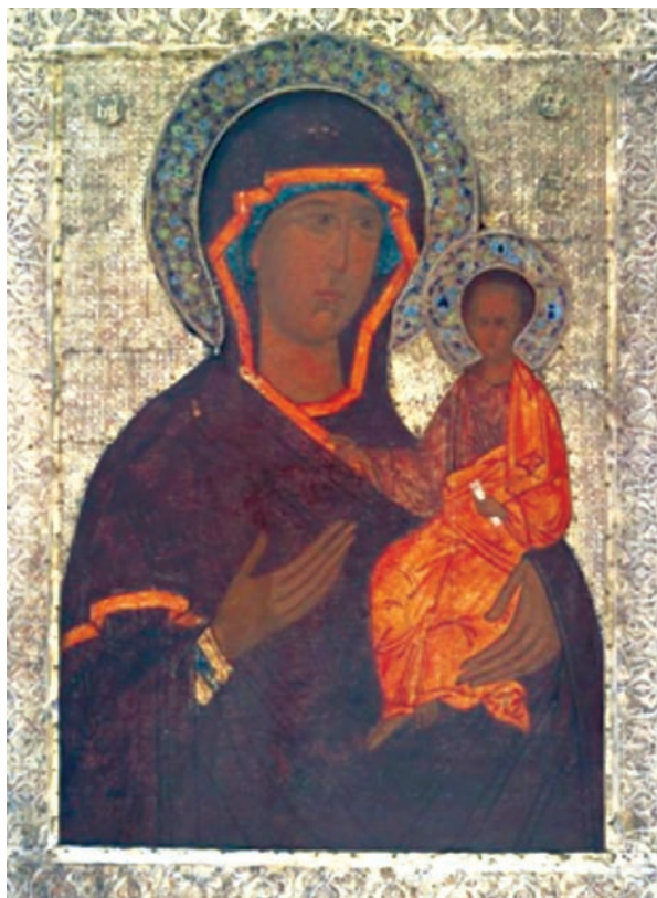
Figure 11. Mother of God Hodegetria. 16th century. 74 cm x 52 cm. BM 94.