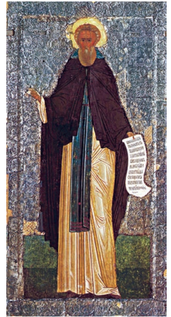
Figure 27. (left) Saint Sergius of Radonezh. Early 16th century. Moscow. Andrey Rublev Museum. (center) Saint Cyril of Beloozero. Late 15th to early 16th century. Saint Petersburg, Russian Museum. (right) Saint Cyril of Beloozero. Late 15th to early 16th century.

icons that served as its prototype have deeper characterization and were done with more energetic and precise draftsmanship. Yet, such small icons replicated the prototype and spread the memory of Saint Cyril to many cities, towns, and villages inside and outside the country.