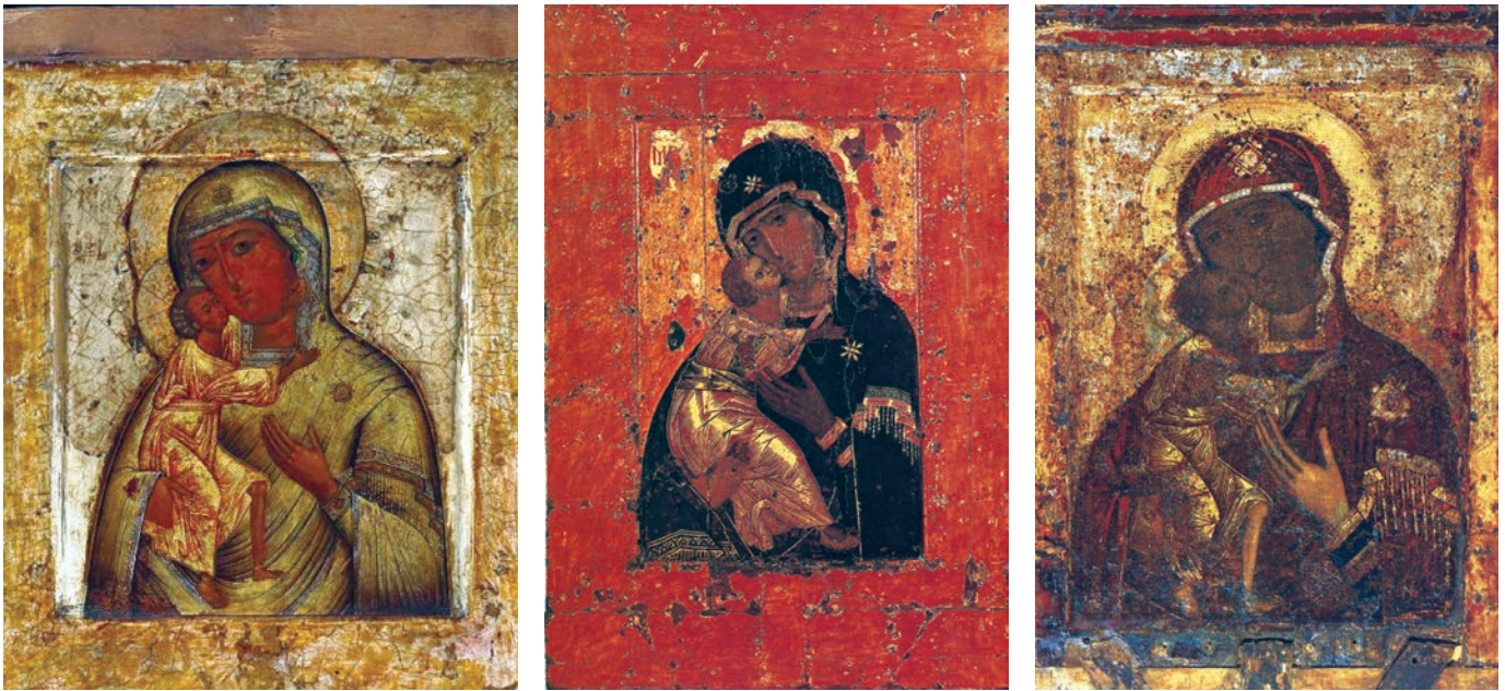
Figure 14. (left) Mother of God Feodorovskaya. 17th century. BM 70. (center) Mother of God Vladimirskaya. Early 12th century. Moscow, Tretyakov Gallery, (right) Mother of God Feodorovskaya. Late 13th cent. Repainted in the 17th century. Kostroma.