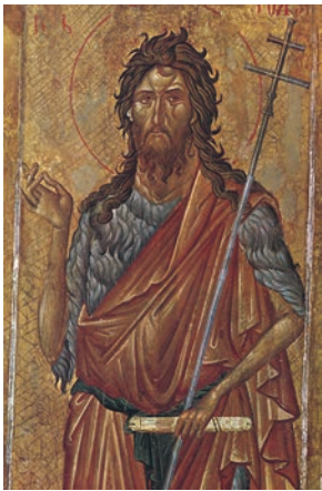
Figure 2. Saint John the Forerunner. Dečani Monastery, Serbia. Circa 1350.

The image of Saint John the Forerunner connects, as it were, figures of the Old Testament and the Gospel (the New Testament) and transfers the fervor of Old Testament preachers and prophets to the world of evangelical events.