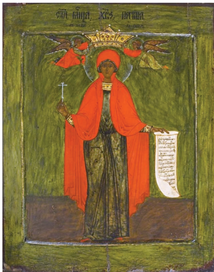
Figure 21. Saint Paraskeva-Piatnitsa. Early 17th century. BM 83.

art, which nevertheless merits special consideration. There are cases when figures of holy women get special emphasis in Russian art as in no other. The scene of The Righteous