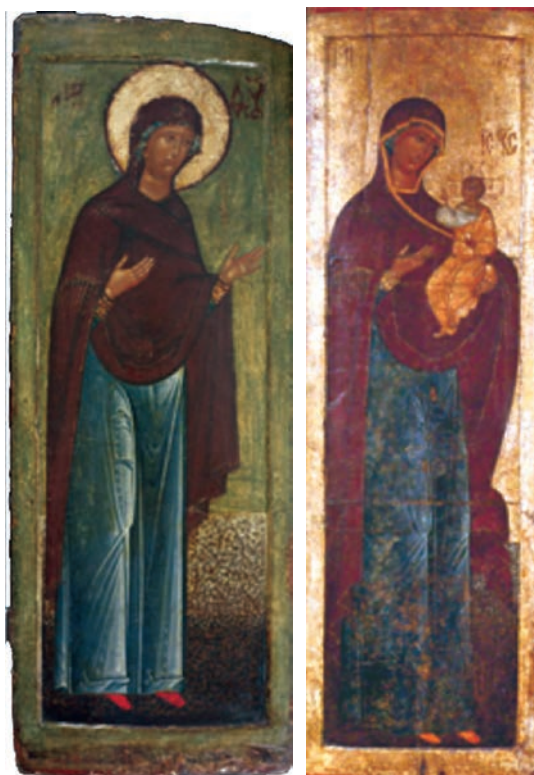
Figure 9. (left) Mother of God, from a Deesis. Circa 1600. 84.5 cm x 32 cm. BM 69. (right) Mother of God with Christ. Early 17th century Stroganov school. Perm' Art Museum.

The other images of the Mother of God under review include bust-length representations of Her with the Christ Child. They are replicas of the especially venerated images of the Mother of God kept in various churches across Russia. Legend has it that the Lord worked different wonders through those icons, which therefore were attributed to miracle-working powers. Special public prayer services were held before them, they were carried in solemn processions, and numerous copies of them were made.