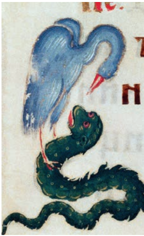
Figure 6. Initial 'B'. Khitrovo Gospels. Early 15th century. Moscow, Russian State Library.

whereas the one from the British Museum is comparatively small (77.4 by 57.4 cm). Yet, both belong to the same transitional stage of Russian icon painting from the dynamic art of the 14 th century to the poetically elegant and calmer images of the 15 th century. That is why it would be correct to date the British Museum icon circa 1400 rather than to the late 14 th century or, taking into account its finer proportions, even to the very beginning of the 15 th century.