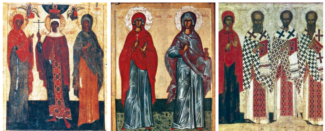
Figure 23. (left) Saints Paraskeva, Barbara and Uliana. Early 15th century. Moscow, Tretyakov Gallery. (center) Saints Paraskeva and Anastasia. 15th century. Saint Petersburg, Russian Museum. (right) Saint Paraskeva and Three Hierarchs. Early 15th century. Moscow, Tretyakov Gallery.