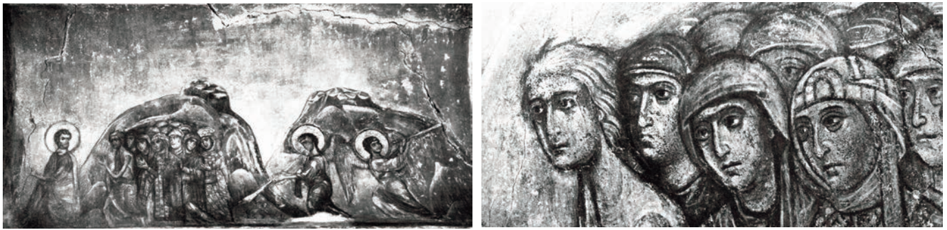
Figure 22. (left) Part of the fresco of the Last Judgment. Late 12th century. Vladimir, Saint Demetrius cathedral. (right) Detail of the Righteous Women Marching to Heaven.