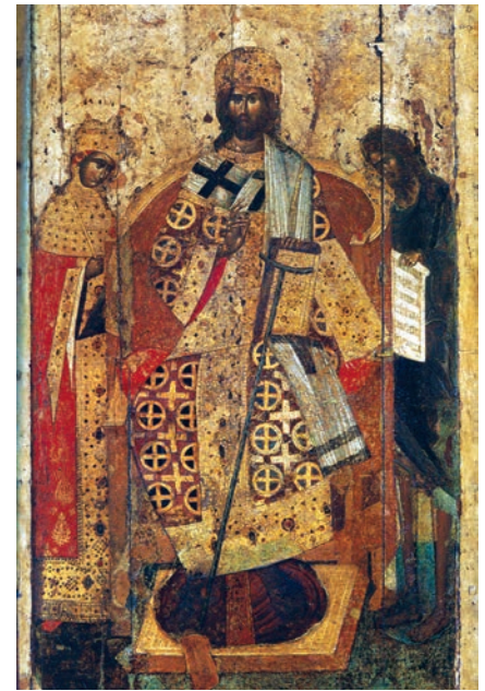
Figure 16. (left) Saint Sophia Divine Wisdom. 17th century BM 54. (center) Saint Sophia Divine Wisdom. Late 15th century. Novgorod, Saint Sophia cathedral., (right) "Stands the Queen...". Late 14th century. Moscow Kremlin, Dormition cathedral.

It was not until the 15 th century that this complicated iconography evolved in the art of the Orthodox world. A Byzantine composition representing Christ as the Great Hierarch, the Mother of God in royal attire, and Saint John the Forerunner was probably used in the 14 th century. It was called Stands the Queen (Figure 16c) after the text of Psalm 45:9: "...at your right hand stands the queen..." It has been assumed that this 14 th -century icon was painted in Novgorod for its Cathedral of Saint Sophia by a visiting (possibly, Serbian) master and was associated with the theme of Saint Sophia the Divine Wisdom.