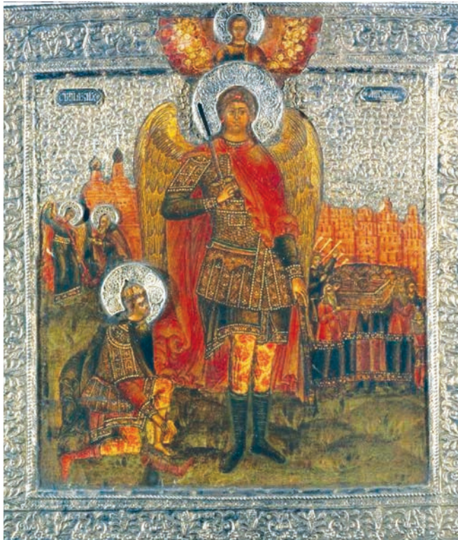
Figure 17. Archangel Michael, with Scenes of Acts and Miracles. Late 17th century. 31,8 cm x 28,4 cm. BM 38.

This small icon from the British Museum reproduced the complicated theological concept of the large image of Novgorod's Saint Sophia Cathedral with stunning precision. It is a rarity even on the scale of Russian icon collections. A noteworthy fact, however, is that the Dormition Cathedral of the Moscow Kremlin has a small piadnitsa icon with the same subject.