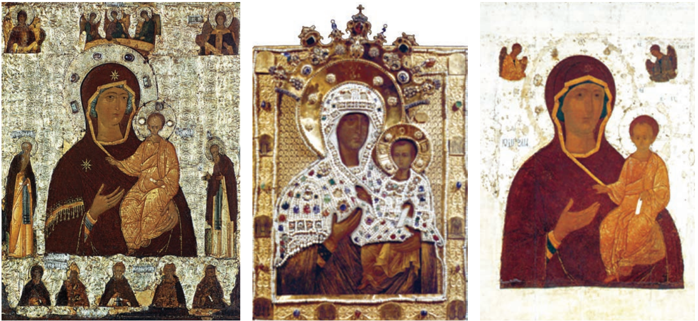
Figure 12. (left) Mother of God Smolenskaya, with Saints. 15th century. Moscow, Tretyakov Gallery. (center) Mother of God Smolenskaya. 15th century (?). Revetment of the 16th century From Novodevichiy monastery. Moscow Kremlin Armory Chamber. (right) Dionisiy. Mother of God Hodegetria. 1482. Moscow, Tretyakov Gallery.