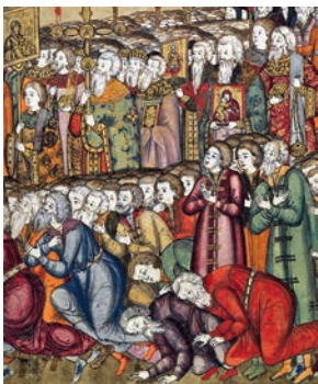
Figure 15. The meeting of the Moscow delegation at Kostroma, 1613. Miniature. Late 17th century. Detail.

and the middle finger of a man's open palm). Depending on their theme, such icons could be put on the analogion to commemorate one saint or another, or an event of holy history, or could be venerated as miracle-working icons. Piadnitsa icons provided representations of old monasteries or images of saints and replicated the iconography of celebrated icons. Obtained by worshippers and pilgrims in large churches and monasteries, they were convenient for transportation and were taken to remote churches or small chapels or else to private homes. One of the functions of such miniature icons was to preserve the memory of the old holy cities alive and to expose them to wider geographic areas. This Feodorovskaya piadnitsa icon of the Mother of God thus references the old Kostroma icon and the events of Russian history associated with it (Figure 15).