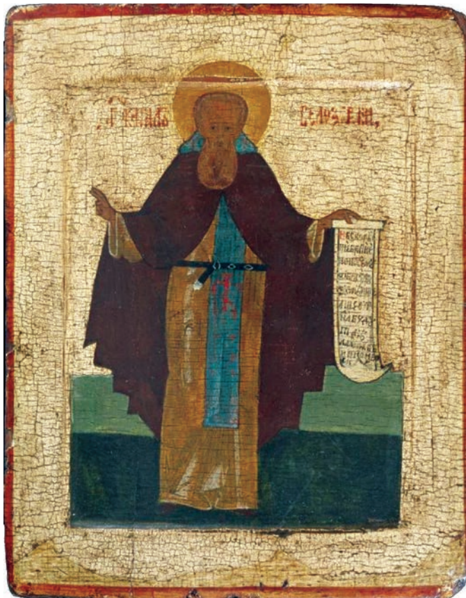
Figure 24. Saint Cyril of Beloozero. Late 16th century. 28,5 cm x 23,2 cm. BM 99.

Her name inscribed in the upper margin is noteworthy: Holy Martyr of Christ Friday. No doubt, the main meaning of this name has to do with the Crucifixion of Christ on Good Friday. However, another circumstance cannot be ignored: churches dedicated to Saint Paraskeva Friday were sometimes built on town market squares and Friday was the principal trading day. Saint Paraskeva Friday thus appeared to be a patron of trade. For instance, Novgorod the Great has an early 13 th -century Church of Saint Paraskeva Friday in the Marketplace, which takes us from the evangelical interpretation of the Saint Paraskeva worship back to folk beliefs. Put together, all of the above proves the many-sided aspects and varieties of the veneration of holy women's images in Rus'.