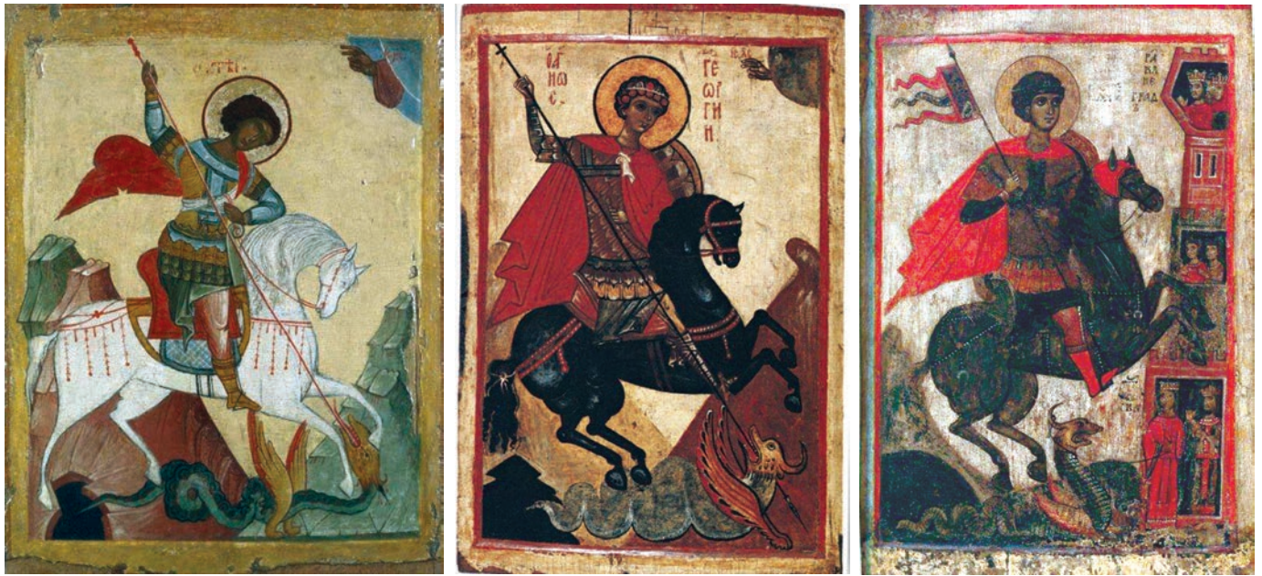
Figure 4. (left) Saint George and the Dragon. First half of the 16 th century. Center: Saint George and the Dragon. Mid-14 th century Moscow, Tretyakov Gallery. (right) Saint George and the Dragon. First half of the 14 th century Moscow, private collection

Many works of 16 th -century Russian painting departed from the poetics of 15 th -century art (known to us from the Andrei Rublev tradition). The 16 th century brought its own aesthetics, frequently referencing an earlier period, namely, the 13 th and 14 th centuries, which appreciated large, heavy and solemn forms. It was from that period that the painter of this Saint George on a White Horse (Figure 4a) borrowed the packed composition and massive figures of the rider and the horse. Meanwhile, the master of the icon of Saint George on a black horse shunned those tendencies. His Saint George wins victory owing to his ties with the divine world rather than his physical might, weight and bulk. And the heavenly world permeates the saint with beauty, movement and spirituality.