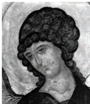
Figure 10. Comparative detail of BM 69 (top) and the Holy Trinity. 1586. Godunov School. Tretyakov Gallery.