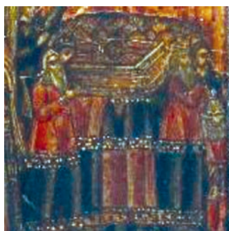
Figure 19. (left): Bearing of the Ark of the Covenant. Detail. BM 38. (right) Bearing of the Ark of the Covenant. Miniature of the Ochtateuch of the 13th century Athos, Vatopedi, Cod. 602.

The other additional scene is the Miracle at Chonae (Figure 20), which was described in the Apocrypha and included, for instance, in the Great Synaxarion, an extensive 16 th -century compilation of texts arranged by the days of the year. The subject is known in art from at least the 14 th century and is associated with the theme of the divine protection of monasteries. Impious pagans wanted to flood the church in the village of Chonae by damming the nearby river. However, Archangel Michael punished the pagans and helped the monk Archippos, who guarded the church, by diverting the river, evidence that the monasteries and monks enjoyed divine protection. The theme was common in Russian art because the celebration of monasticism and monasteries was generally typical of Russian culture. Let it be remembered that from the 14 th century there was a monastery in the Moscow Kremlin with its major church dedicated to the Miracle of the Archangel