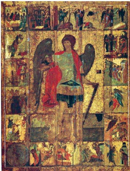
Figure 5. Archangel Michael with Scenes of His Acts. circa 1399. Archangel Michael Cathedral, Moscow Kremlin. 235.5 cm x 182 cm.

Although the black horse is not a unique feature of this old icon from the British Museum, it is rather rare in Russian icon painting. But there are other examples (Figure 4b and Figure 4c).